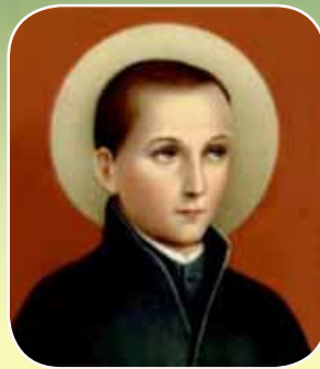
St. John Berchmans