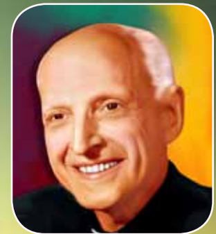
Fr. Pedro Arrupe